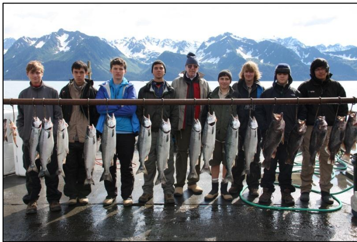
Deep Sea Fishing, Kenai Fjords NP

Our first trek to Alaska was to the rain forest environment south of Anchorage where the coastal mountains are draped in glaciers and capped with icefields. We rafted the Kenai River and then camped in Seward where we explored Kenai Fjords National Park. The weather was cool, overcast and intermittently rainy for much of the trip but the trekkers were properly prepared despite the dramatic change from the Houston Gulf Coast area.