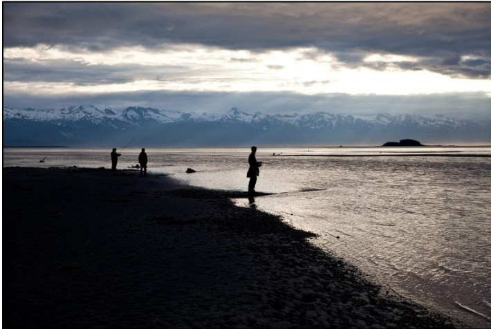
Shore Fishing, Tongass NF

Trek activities: Hiking, Shore Fishing, Gold Mining, Zip Lining and Cycling in Chugach National Forest.