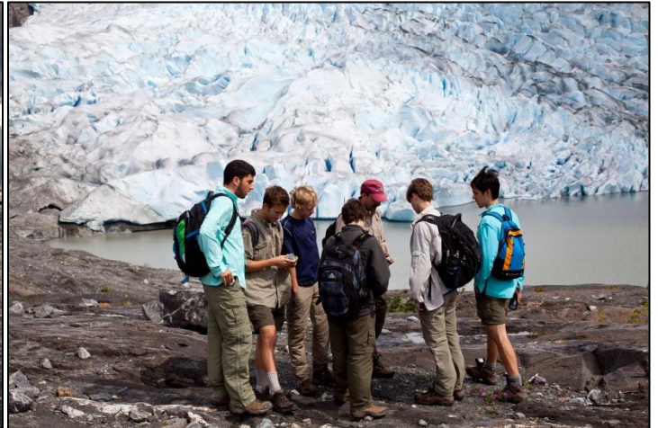
Seeking Gold, Mendenhall Glacier, Tongass NF