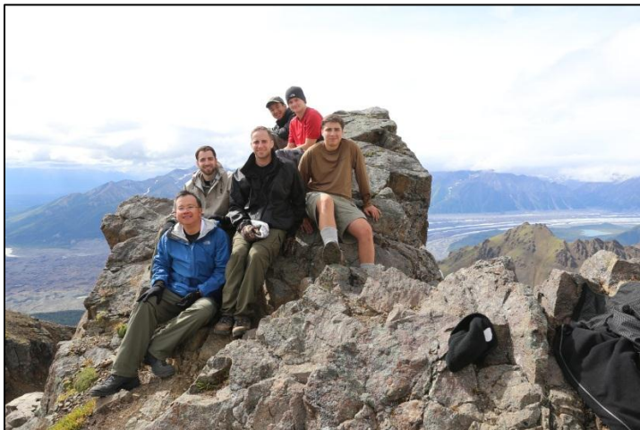
Hiking Bonanza Peak, Wrangell St. Elias NP

Trek activities: Hiking and Mine Touring in Wrangell St. Elias National Park; and deep sea fishing near Valdez.