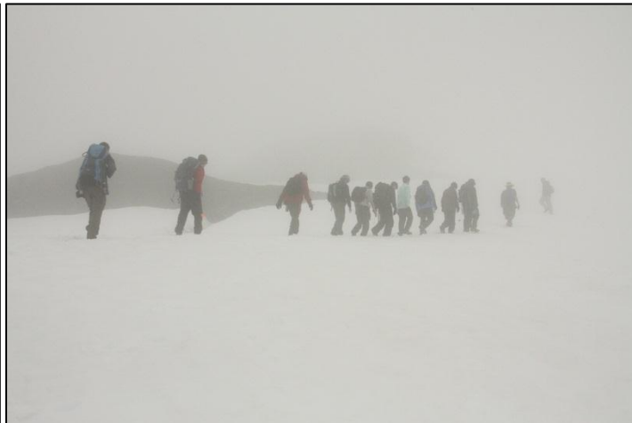
Hiking Harding Icefield, Kenai Fjords NP