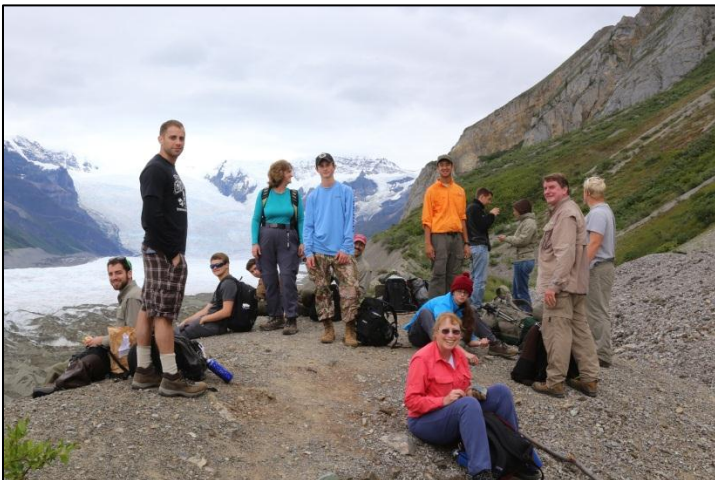
Hiking to Stairway Icefall, Wrangell St. Elias NP