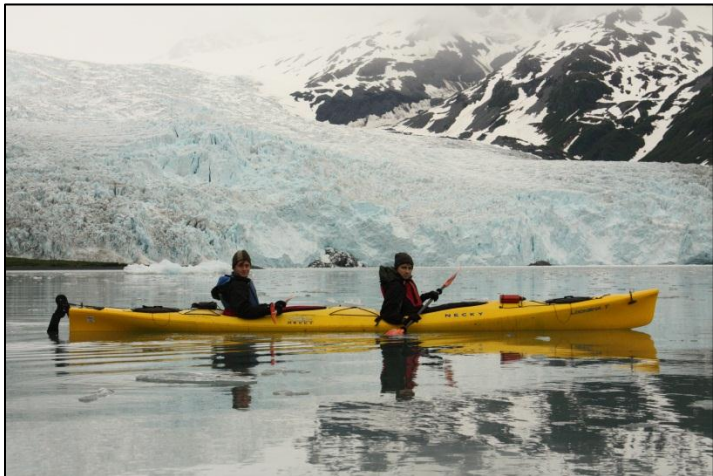
Kayaking Aialik Bay, Kenai Fjords NP

Trek activities: Sea Kayaking, Deep-sea Fishing and hiking in Kenai Fjords National Park; and rafting in Chugach National Forest.