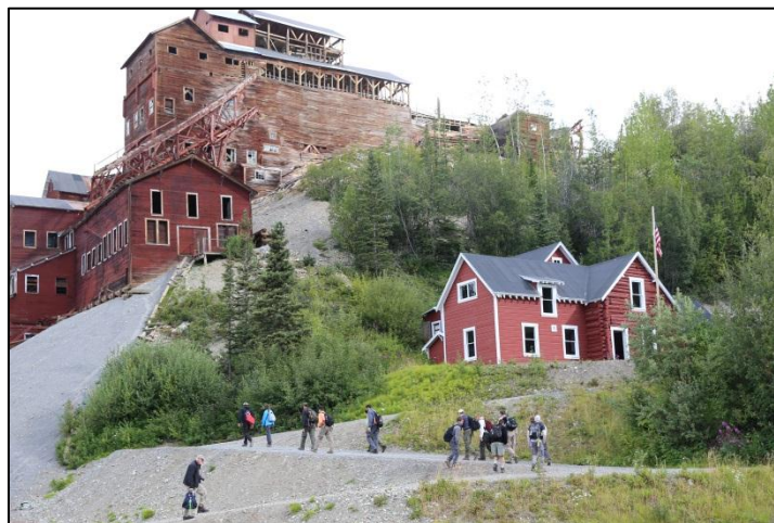
Kennecott Copper Mine Tour, Wrangell St. Elias NP

Our third Alaska trek was to the boreal forest and massive Wrangell Mountain Range in eastern Alaska with a side trip to Valdez for some deep sea fishing for salmon. Our hikes and mine tour in Wrangell St. Elias NP were glorious as the sun popped out to reveal incredible vistas of glaciers spilling out of towering mountains. The trekkers were individually pleased to accomplish these strenuous and challenging hikes.