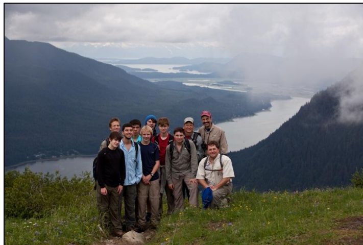
Hiking Mount Roberts, Tongass NF

Our second Alaska trek was to southeast Alaska near Juneau where coastal mountains, glaciers and gold mines combined to make a great high adventure in a rainforest environment. We hiked up Mount Roberts, hiked to Mendenhall Glacier, cycled and zip lined through the rainforest, and learned the geology of gold mining both in the field and in mines. Shore fishing for salmon made for some great experiences and wonderful dinners!